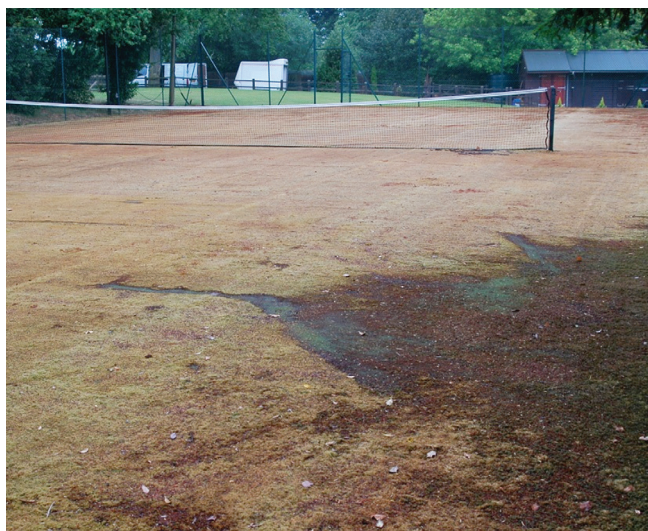
Artificial grass tennis court covered in moss