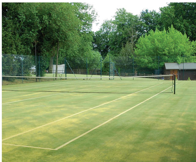
Artificial grass tennis court with moss removed

As well as moss and weed control on paths and other hard areas, New-Way Weedspray can be used to treat artificial sports surfaces. As there are a wide variety of materials employed for this use, always test on a small area to confirm the suitability of NewWay Weedspray before applying to the entire playing surface.